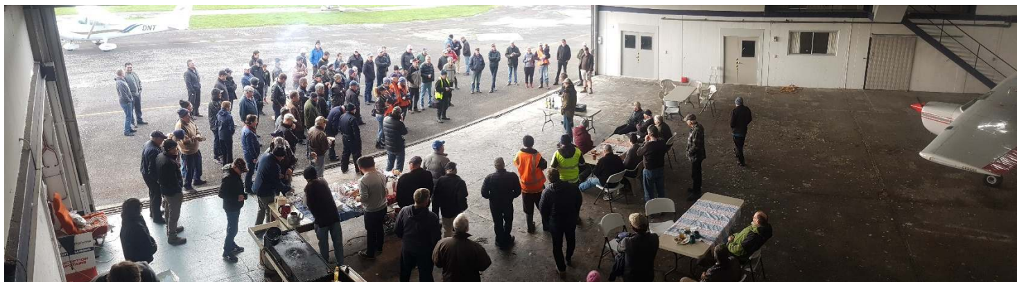
Feilding Dawn Raid 09/06/2019